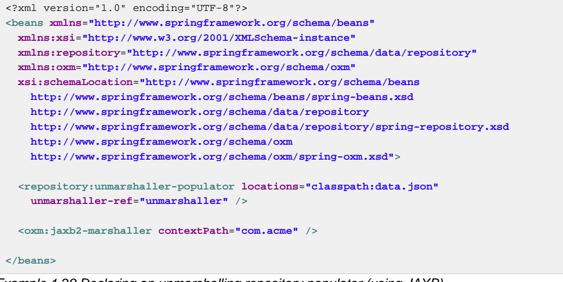
Example 1.29 Declaring an unmarshalling repository populator (using JAXB)