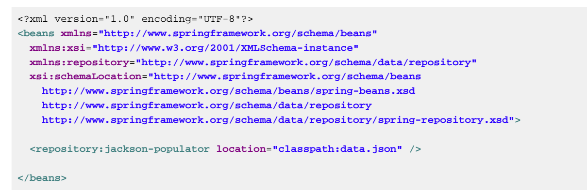
Example 1.19 Declaring a Jackson repository populator

This declaration causes the data.json file being read, deserialized by a Jackson ObjectMapper. The type to which the JSON object will be unmarshalled to will be determined by inspecting the _class attribute of the JSON document. The infrastructure will eventually select the appropriate repository to handle the object just deserialized.