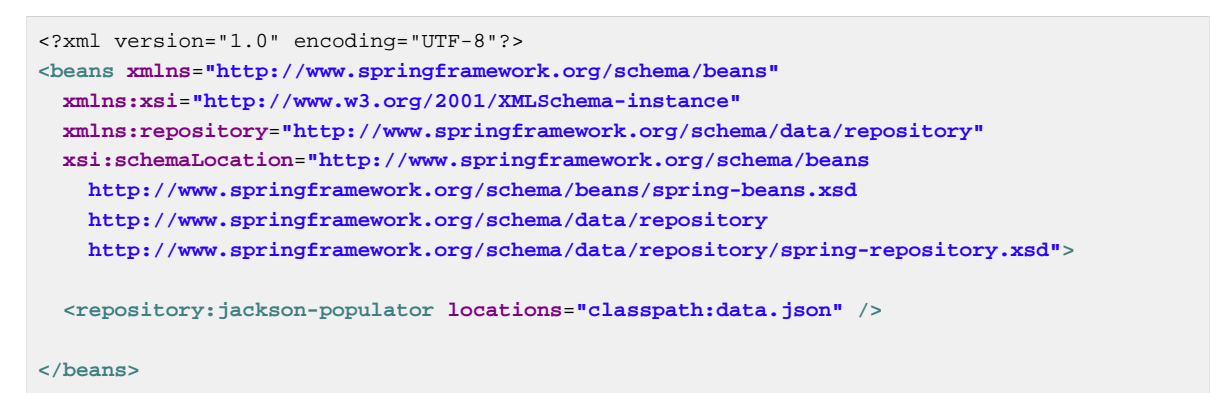
Example 3.26 Declaring a Jackson repository populator

This declaration causes the data.json file to be read and deserialized via a Jackson ObjectMapper. The type to which the JSON object will be unmarshalled to will be determined by inspecting the _class attribute of the JSON document. The infrastructure will eventually select the appropriate repository to handle the object just deserialized.