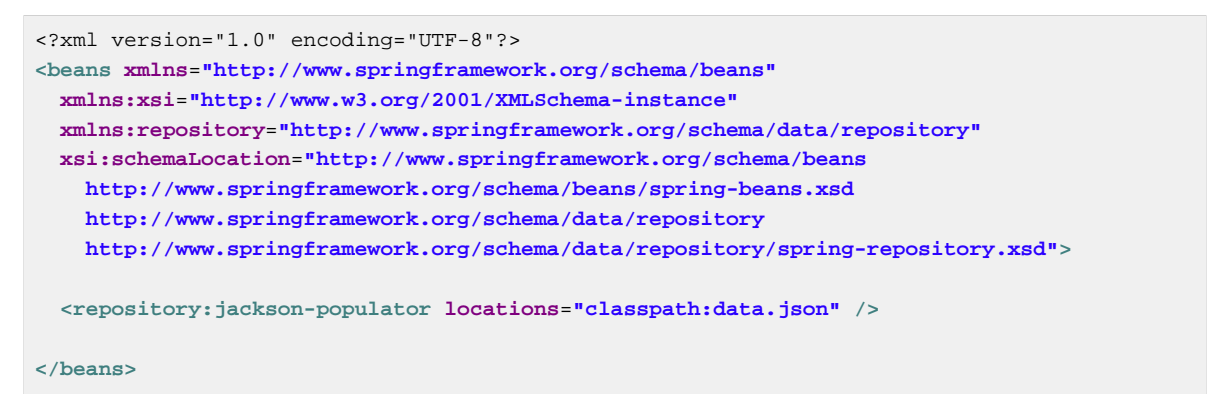
Example 1.26 Declaring a Jackson repository populator

This declaration causes the data.json file to be read and deserialized via a Jackson ObjectMapper. The type to which the JSON object will be unmarshalled to will be determined by inspecting the _class attribute of the JSON document. The infrastructure will eventually select the appropriate repository to handle the object just deserialized.