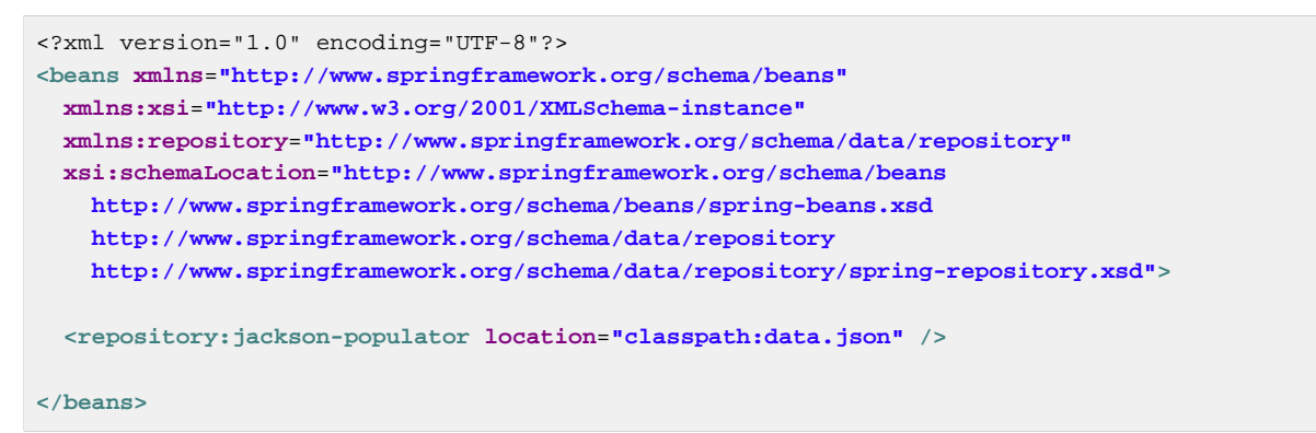
Example 1.19 Declaring a Jackson repository populator

This declaration causes the data.json file being read, deserialized by a Jackson ObjectMapper. The type the JSON object will be unmarshalled to will be determined by inspecting the _class attribute of the JSON document. We will eventually select the appropriate repository being able to handle the object just deserialized.