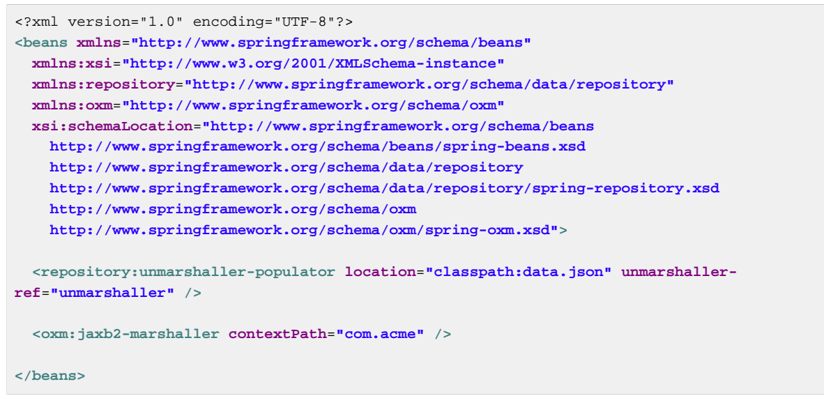
Example 1.20 Declaring an unmarshalling repository populator (using JAXB)

To rather use XML to define the repositories shall be populated with you can use the unmarshallerpopulator you hand one of the marshaller options Spring OXM provides you with.